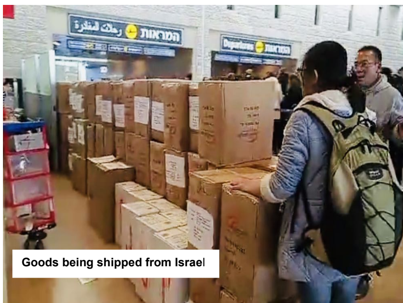
Goods being shipped from Israel